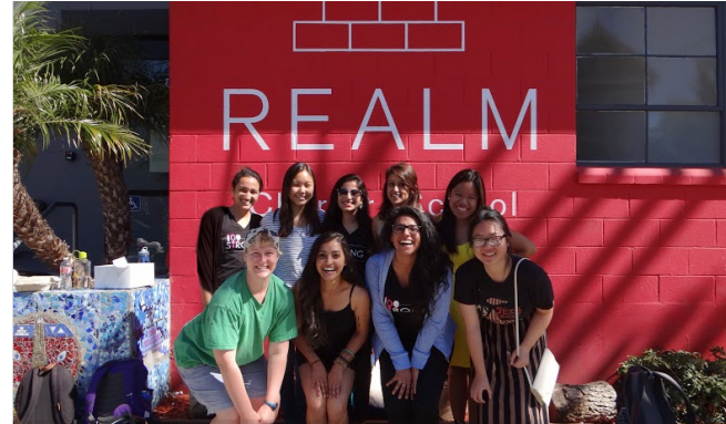
In 2014-2015, 100 Strong mentors are working with all 50 8th grade female students at REALM Charter Middle School in Berkeley.

100 Strong is participating in a crowdfunding campaign with Indiegogo to raise $5,000. The money would help