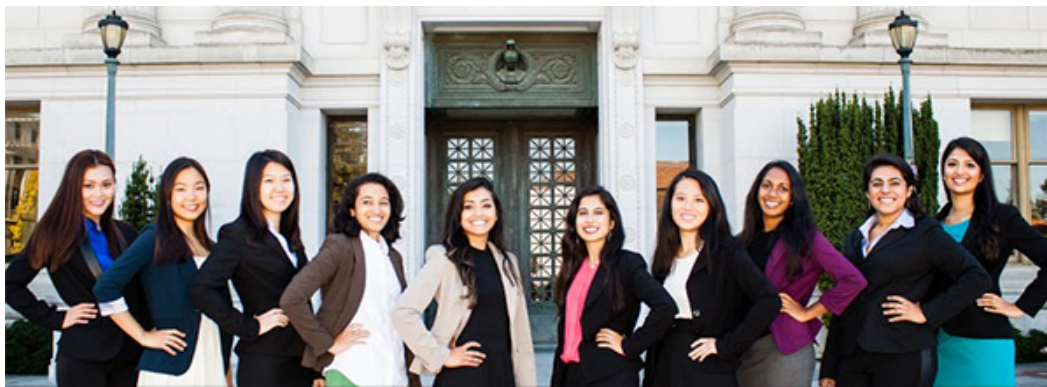
100 Strong was founded in 2013 by five UC Berkeley women undergraduates to develop the leadership potential of low-income high school and middle school girls in the Bay Area. The group has since grown to include dozens of Cal mentors.