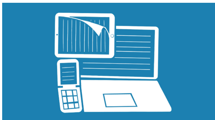
Big Ideas @ Berkeley and USAID's Global Development Lab want students to dream up technology-based innovations to enhance reading skills for youth in poor countries.

Leege believes that among the greatest barriers to innovation in mobile reading are access to electricity and connectivity. "To assist those learning to read in low-resource settings, low-cost and open source materials easily maintained by the user are vital," she said. "We would like to see student innovation that addresses unreliable—or absent—electricity and connectivity in low-resource communities."