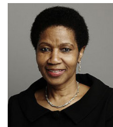
Dr. Phumzile Mlambo-Ngcuka

Mlambo-Ngcuka called the next 15 years, 2015-2030, a critical period for women's rights internationally. "I would like us to see this period as the last mile. We are going to intensify the struggle of hundreds of years. We should not, however, see this as an open-ended struggle," Mlambo-Ngcuka said. "In Portuguese we call it 'A Luta Continua' (the struggle continues), but it must end at some point."