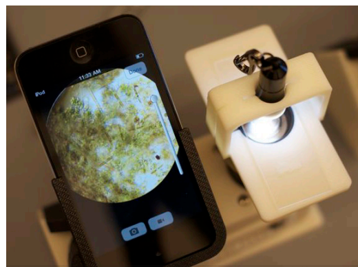
Due to advances in mobile phone technology, CellScope may soon provide diagnostic solutions at the same rate as any digitally enhanced microscope in a well-equipped hospital.

Not only was the potential for disease diagnosis outside of hospital infrastructure considerable, Fletcher and