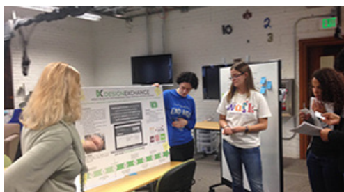
The second DIL Innovation Crawl brought students to the Berkeley Institute of Design.