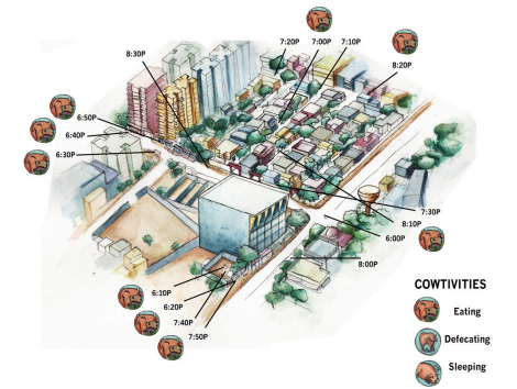
Maps that Hui drew to document how cows inhabited the city and dealt with different urban realities such as traffic.

Toto Express' platform will provide a way for corporations both to meet their gifting needs and meet government mandates. In turn, artisans will benefit from growing profits that will allow them to stay in their trade and village.