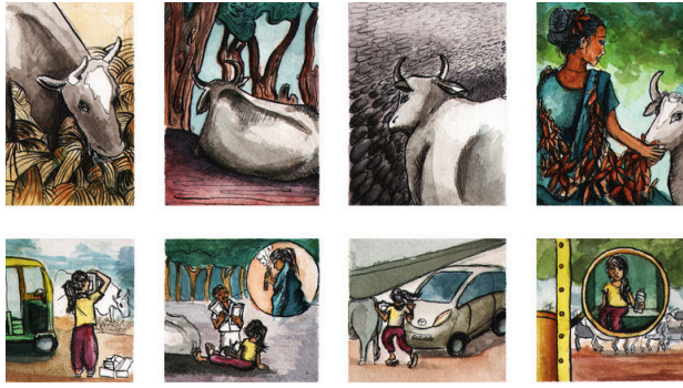
Some of Hui's sketches showing the city from the cows' perspective.

Hui has argued that protection of urban animals and wildlife can strengthen urban planning and public policy. As an expansion of her project, she attempted to study elephants in Tamil Nadu and leopards in Mumbai's Sanjay Gandhi National Park, and noticed that that bureaucracy or real estate interests were often prioritized over conservation. If the elephants' migration patterns were accounted for, she argued, then city planners could create grassy overpasses and roadways to protect wildlife, while still developing for larger human populations.